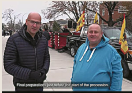
Final preparations just before the start of the procession.